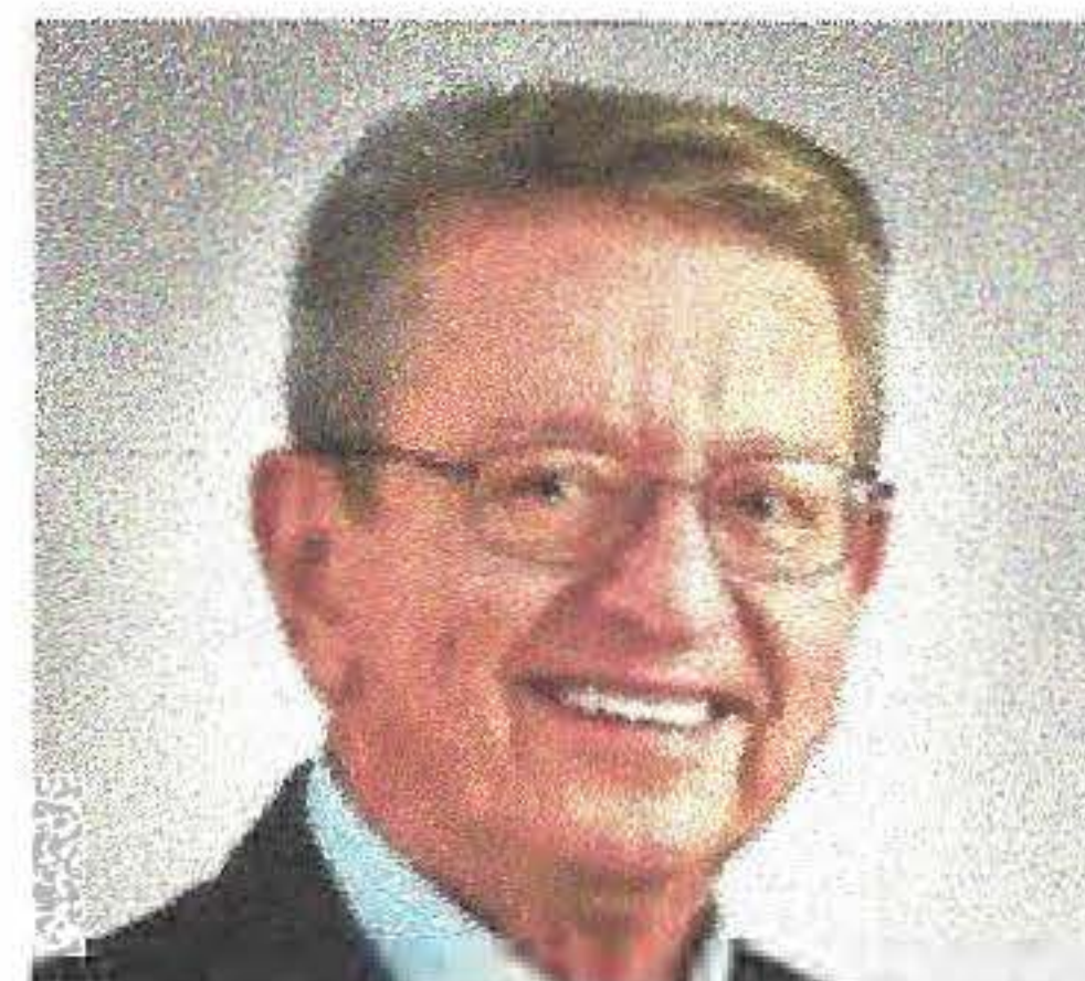
Terry Teykl Prayer Point Ministries